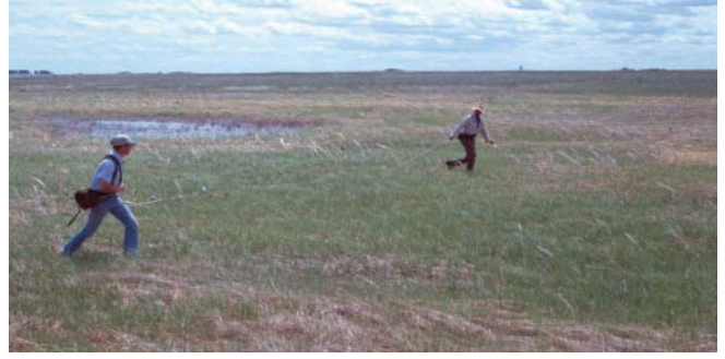
Researchers use the rope-drag technique to flush birds from the grass in the quest to locate tiny nests concealed in the vegetation.

Murphy and his colleagues surveyed thousands of nests, which is no simple task. To find the tiny nests buried in the grass they used the tried-and-true rope drag technique: a researcher at each end of a long rope that they drag through the grass. They watch to see what flies up—and try to determine from where.