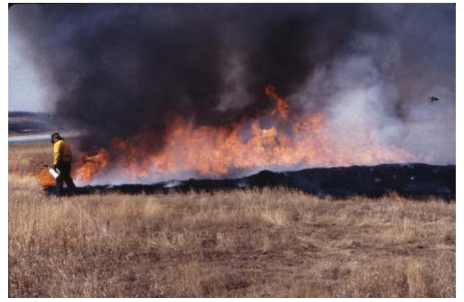
Prescribed fire in the northern mixed-grass prairie at Des Lacs NWR North Dakota.

a natural ecosystem process. The fires remove dead vegetation and litter, reduce invasion by non-native plants, keep trees and shrubs at bay, and restore nutrient cycles.