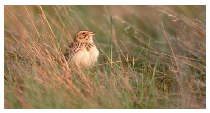
A Baird's sparrow perched in the grasses of Lostwood NWR. The breeding range of the Baird's sparrow is restricted to northern mixed-grass prairie. Despite prairie remnants set aside for conservation in the eastern portion of their range, the species has become rare. Fire has been excluded from these tracts for decades.

Grassland songbirds evolved with specific needs that restrict where and how they can obtain food and build nests. Most of them can only nest in certain types of grass and will not tolerate trees in the landscape. In addition, they aren't physically adapted to move around in dense plant litter when they forage for food. Depending on the species, they need varying degrees of open ground amidst the grass plants as they hunt for bugs and caterpillars.